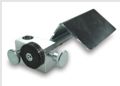
Item No. 17358 Workpiece support with angle adjustment