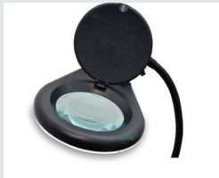
Item No. 18070 LED precision optical lens lighted